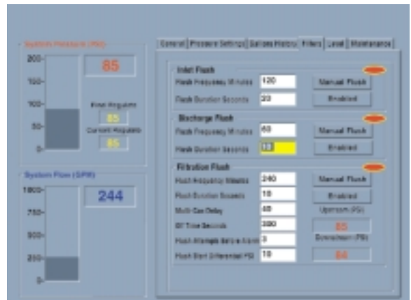
Control and monitoring of all filtration units.