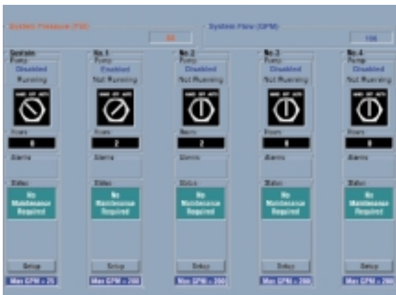
Detailed information allows users to monitor and maintain each pump.