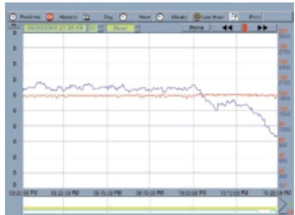
Graph critical information for system analysis