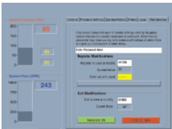
Fine tune any aspect of pump operations.