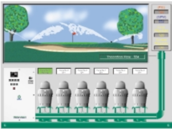
Full graphical operator interface.