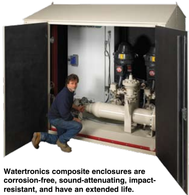
Watertronics composite enclosures are corrosion-free, sound-attenuating, impact-resistant, and have an extended life.