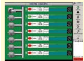
Watervision® controls the station remotely from your PC, and Pump-Link® integrates with your irrigation central software