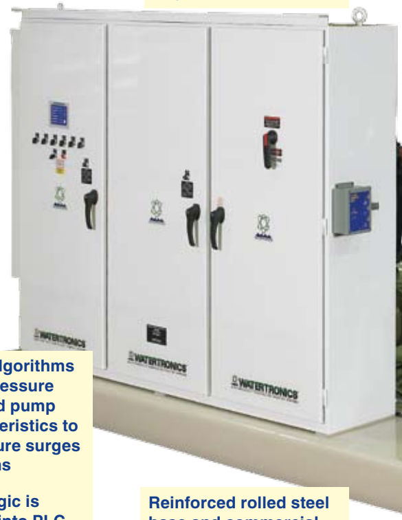
Unique PLC algorithms to optimize pressure regulation and pump curve characteristics to reduce pressure surges on the systems