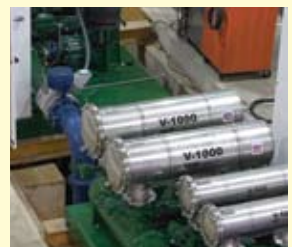
Stainless Steel Filter that is impervious to corrosion, Filter Flushing Mechanism, Flush Valve utilizing an EBV System