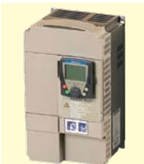
Watertronics® fine tunes VFDs to achieve near perfect pressure regulation