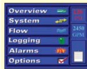
VirtualVision™ touch screen - important functions right at your finger tip

Watertronics stainless steel level transducer are unaffected by water quality, provide repeatability down to a fraction of an inch, and allow for adjustable start/stop lake level set points, and graphing capability. They can be managed by either Watervision or via VirtualVision II.