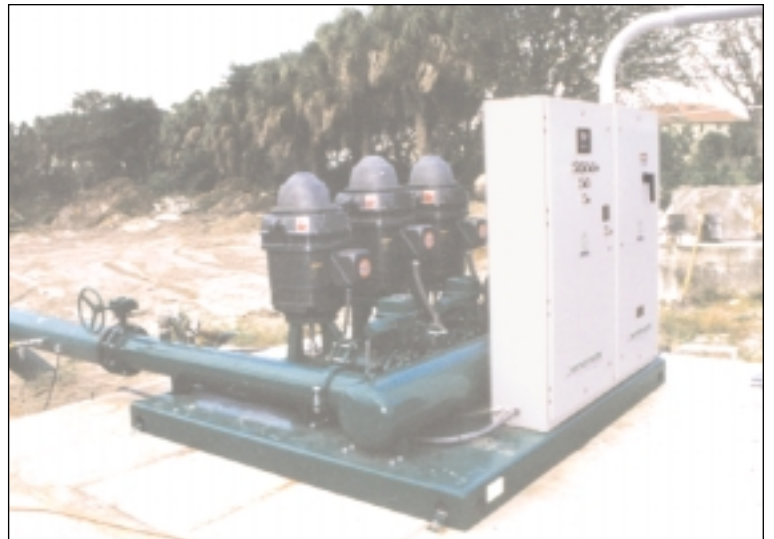
Kelly Greens Golf & Country Club Ft. Myers, FL 2000 GPM EBV Pressure Regulation Electronic Soft Starting