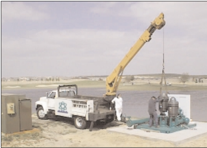
Kings Ridge Clermont, FL 3000 GPM EBV Pressure Regulation Electronic Soft Starting