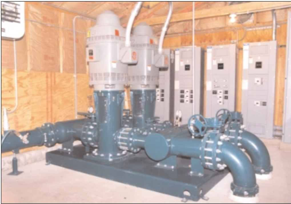
Grand Geneva Resort Lake Geneva, WI (High Pressure Booster) 1200 GPM @ 400 PSI VFD Regulation