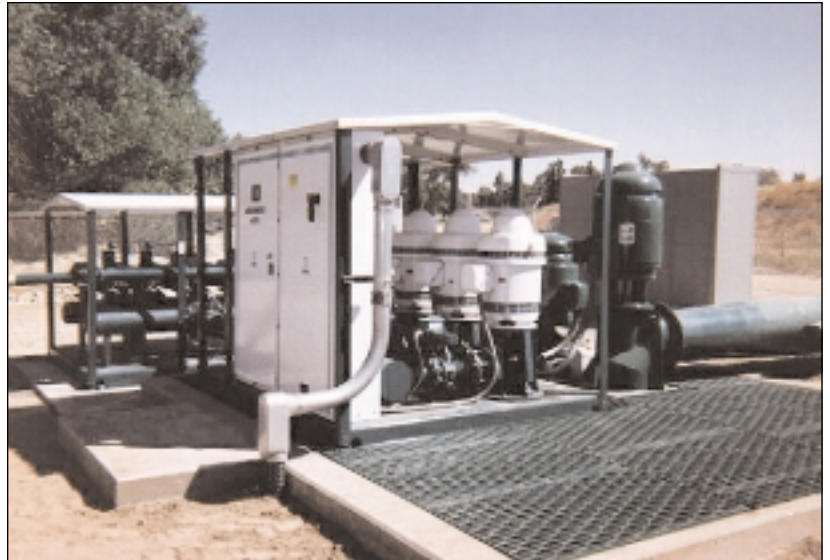
Dove Valley Phoenix, AZ 2200 GPM EBV Pressure Regulation Electronic Soft Starting